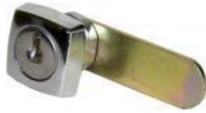
Square faced cam lock for steel furniture