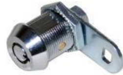
Cam lock with radial key

Ordering options for cam locks may include: