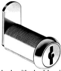
Cam lock with double-sided key

Other low cost Cam Locks include the following: