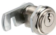
CISA SP 5 pin Cam lock

The better quality cam locks mostly have brass bodies and pin-tumbler mechanisms, or sophisticated disc systems, offering many different keys for greater security. Quality locks can be ordered master-keyed (all different keys and a master key) or keyed alike (all with the same key).