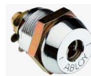
ABLOY disc tumbler cam lock body

The less costly cam locks usually have zinc or mazac bodies and most of them have 4 wafer tumblers.