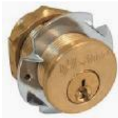
4-pin-tumbler brass cam lock body

The better quality cam locks mostly have brass bodies and pin-tumbler mechanisms, or sophisticated disc systems, offering many different keys for greater security. Quality locks can be ordered master-keyed (all different keys and a master key) or keyed alike (all with the same key).