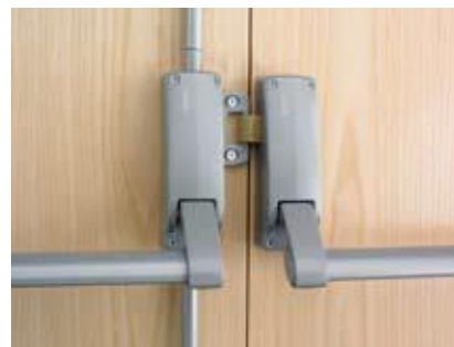
Industrial solution for a pair of double doors

DON'T WAIT FOR IT TO BECOME A burning issue!