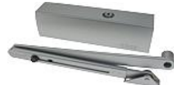
DORMA door closers for every hinged door!