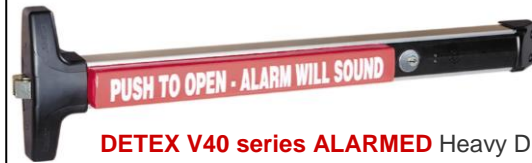
DETEX V40 series ALARMED Heavy Duty Panic Latch (withstands 600 Kg)

Outside access using keys is an option with most panic devices. CISA SP #136 or ASTRAL TEKNA S01 High Security cylinders & keys are available at nominal extra cost