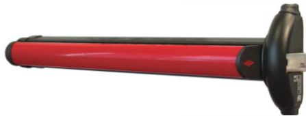
Typical Panic Latch

We have many viable solutions that comply with regulations, to protect your people and assets