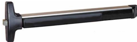
DETEX V4001 x ER Panic Latch with electric release for fire exit doors needing access control