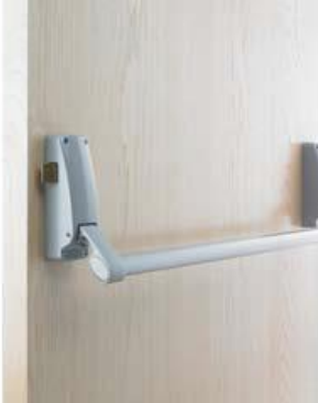
Industrial latching panic bar

From the Boardroom Door - to the Factory Floor – we have secure solutions that work!