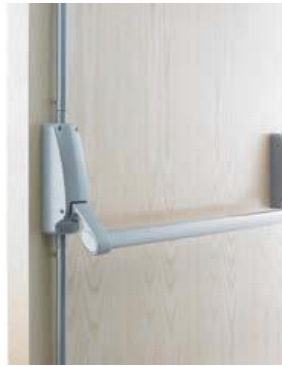
Industrial Panic bar with vertical locking rods for better security against outside attack