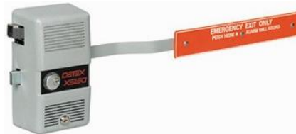
DETEX ECL-600 ALARMED Latching & Deadlocking Panic Device for narrower doors