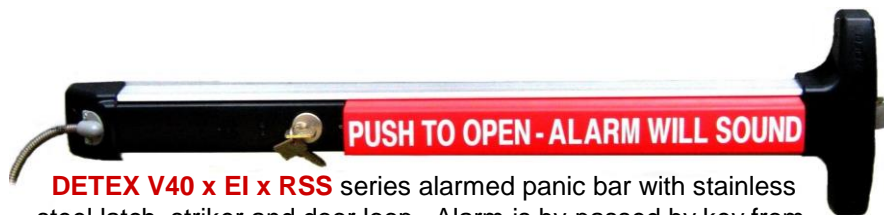
DETEX V40 x EI x RSS series alarmed panic bar with stainless steel latch, striker and door loop. Alarm is by-passed by key from the inside. Available with remote monitoring via cable or by transmitter signal

CISA SP #136 or ASTRAL TEKNA S01 cylinders & bypass keys are optional on all DETEX products at nominal extra cost. These keys made by us only against authorised signatures - which must match samples lodged with us.