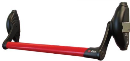
Industrial Quality Panic latch