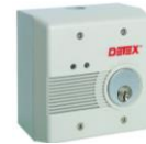
DETEX EAX series alarms with key bypass – can be fitted to any door