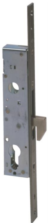
Typical hook-bolt lock for aluminium doors

Hook-bolt locks are different in that the locking bolt moves vertically (i.e. up and down) instead of horizontally (in and out) and the bolt of the hook-lock penetrates deeper into the striking plate (which must always be fitted)!