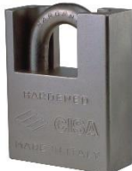
CLOSE SHACKLE Padlocks