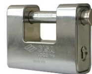
Armoured Padlock with rolling shackle

A padlock is only as good as the hasp or other device upon which it is hung! Climate is an important factor – better quality is needed outdoors.