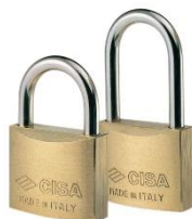
Standard & long shackle brass padlocks