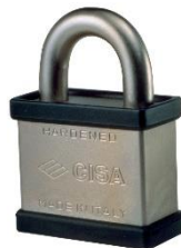
Steel padlock with ball-locking shackle