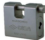
Steel padlock with rolling shackle