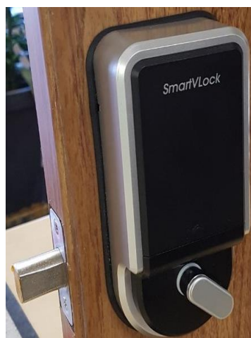
Inside view showing thumbturn for exit

Smart, robust, easy to install and use; NO wires, power supplies or infrastructure needed. Management can REMOTELY add or delete guests without visiting the site.